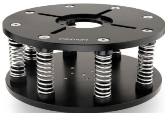
Proaim Spring-cam Mitchell vibration Isolator

Please inspect the contents of your shipped package to ensure you have received everything that is listed below.