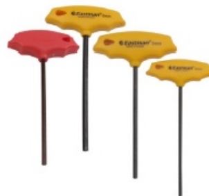
T-Type Allen Key (4mm, 5mm, 5/16mm, 6mm)