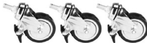
3 x Caster Wheels