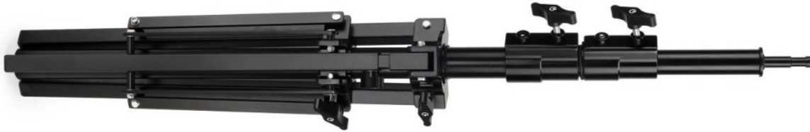
Alpha Docking Universal Support Stand with 5/8" Baby Pin Mount

Please inspect the contents of your shipped package to ensure you have received everything that is listed below.