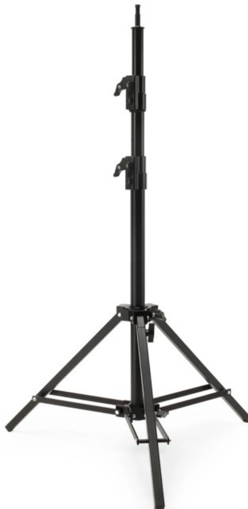
Alpha Docking Universal Support Stand