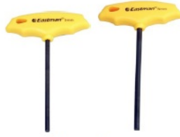
5mm, 6mm Allen keys