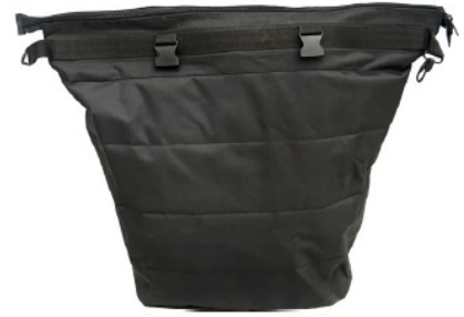
Vest Bag packing