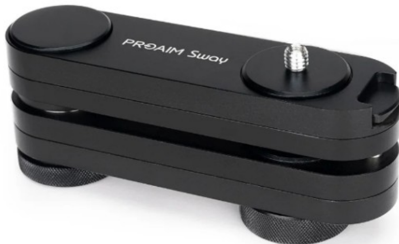
Sway Portable Slider for DSLR Video Camera (SL-051-00) Assembly Manual