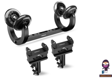
PROAIM P-MNRL-01 Monorail Camera Slider Dolly