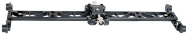
Proaim 4ft Line Slider

Please inspect the contents of your shipped package to ensure you have received everything that is listed below.