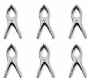
Backdrop Support Spring Clamp

Please inspect the contents of your shipped package to ensure you have received everything that is listed below.