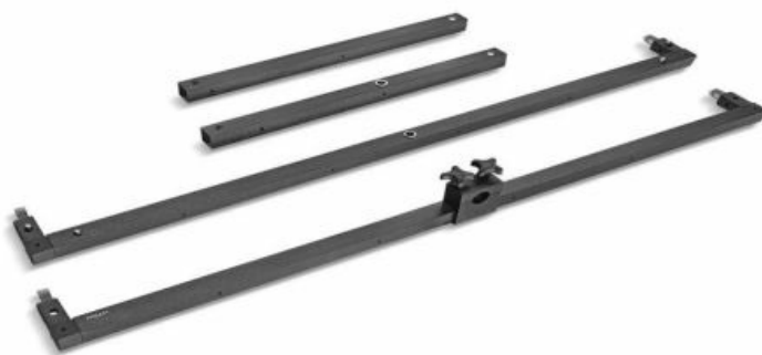
Proaim Background Frame