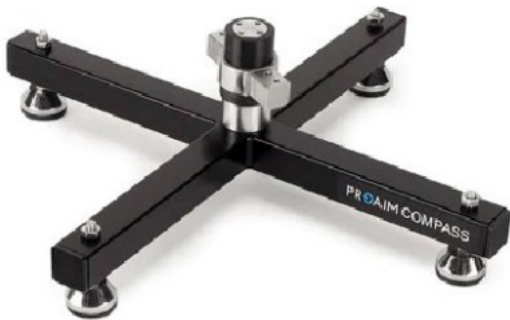
Dolly Base Leg

Please inspect the contents of your shipped package to ensure you have received everything that is listed below.