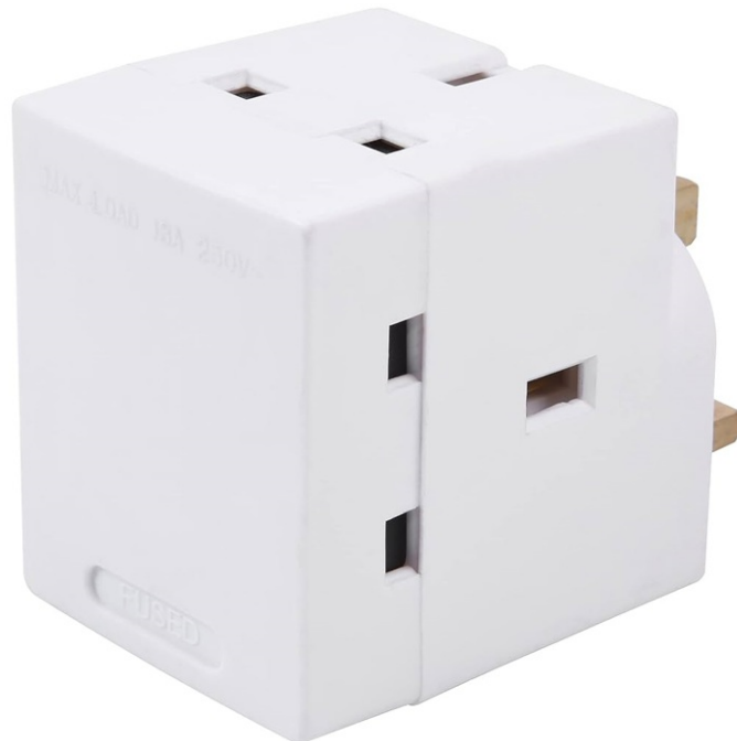
MULTI-PLUG ADAPTOR 13A FUSED 3 WAY PELB1601