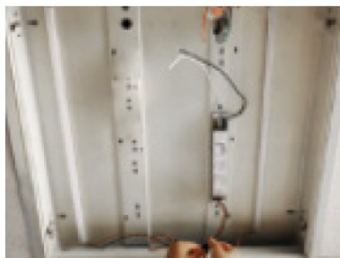
5. Connect driver's input line: Dim +, Dim - and module lines.