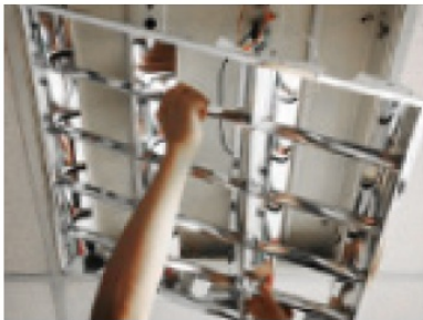
1. Remove the lens or louver (if required).

WARNING DISCONNECT POWER BEFORE INSTALLING OR SERVICING.