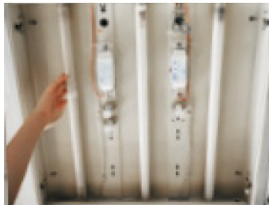
2. Disconnect wires and remove the original fluorescent tube(s) and ballast from the existing fixture. (Recycle tubes according to state specific recycling guidelines).