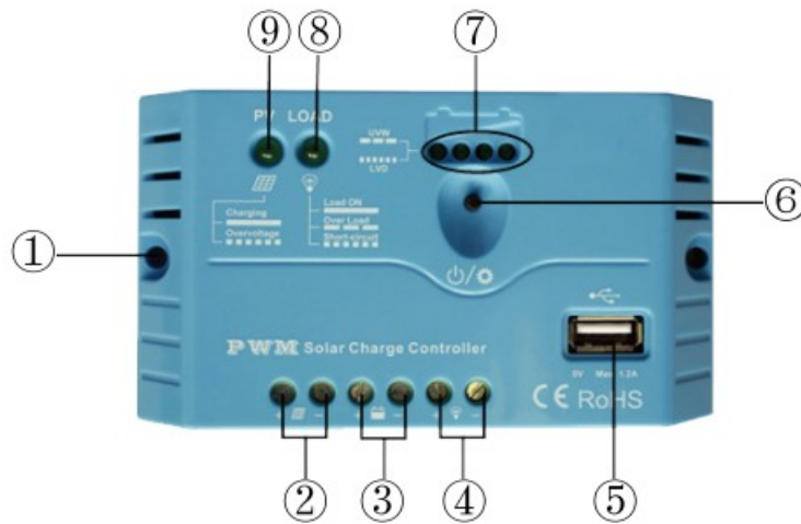
Figure 1 Product Feature