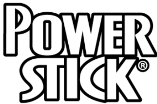
Multi Positional Wireless Charging Stand