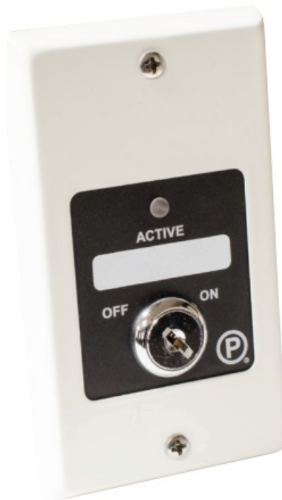
PAD100-LEDK Addressable LED With Key Switch