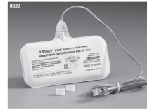
Posey M6220 Single Patient Use Toilet Sensor Pad