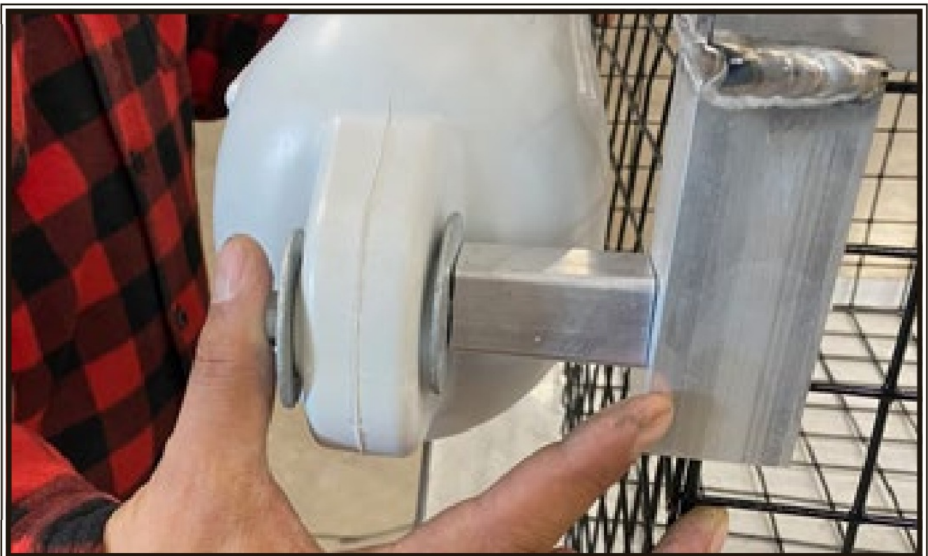
Figure 2: Outside Cage Float Hardware

Step 5: Line up one of the vinyl floats with 3/8" bolts (A), tube bushings (B) and large washers (C) to the outside of the frame and cage as pictured in Figure 2.