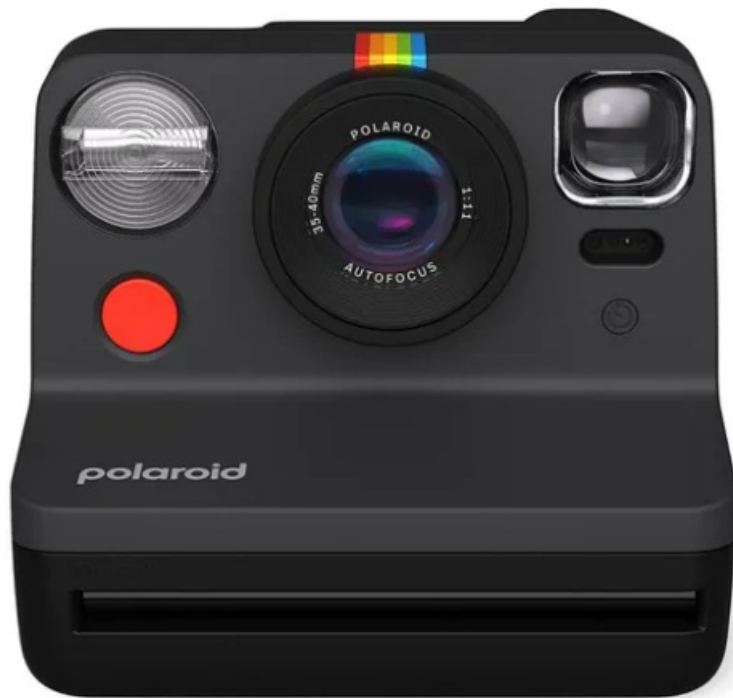
Polaroid Now+ Instant Camera Generation 2