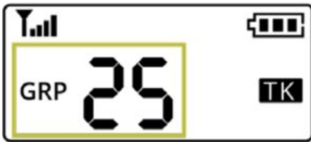
Figure 1: Group Edit Screen

Then, use the Volume +/- buttons to select a group number from 0–51. Short-press Mode to save your selection and proceed to ID setting.