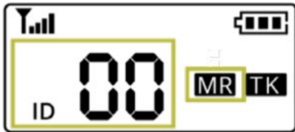
Figure 2: ID Edit Screen (Master ID)