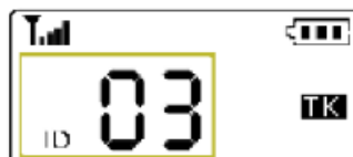
Figure 2: ID Edit Screen

Important: Beltpacks must have the same group number to communicate.