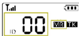
Figure 3: ID Edit Screen (Master ID)