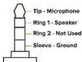
Figure 4: TRRS Connector

Use the diagram of the wiring for the beltpack’s TRRS connector if you choose to connect your own headphones. The microphone bias voltage range is 1.9V DC unloaded and 1.3V DC loaded.