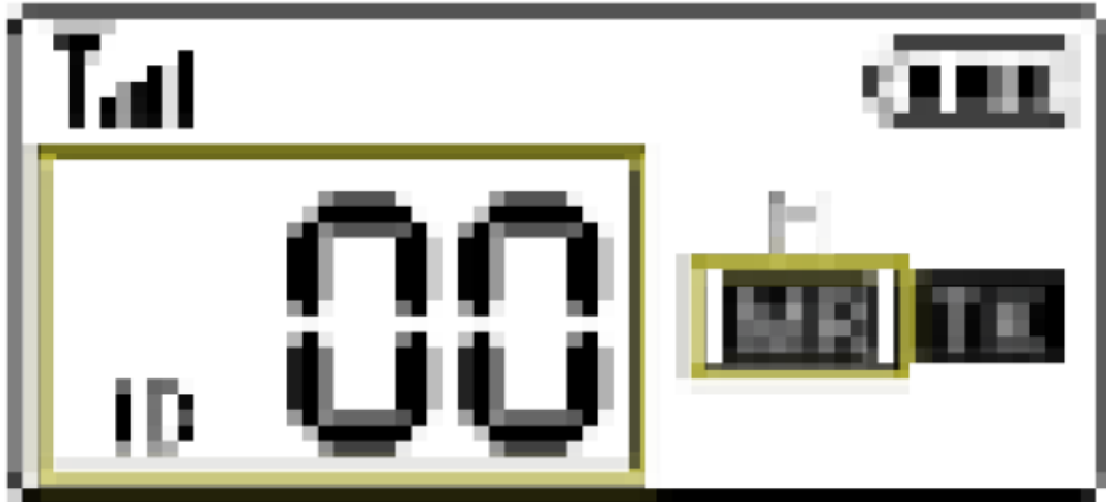
Figure 2: ID Edit Screen (Master ID)