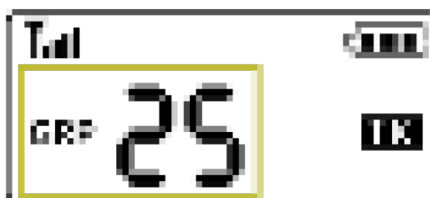
Figure 1: Group Edit Screen

IMPORTANT: Belt packs must have the same group number to communicate.