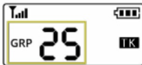
Figure 1: Group Edit Screen

IMPORTANT Belt packs must have the same group number to communicate.