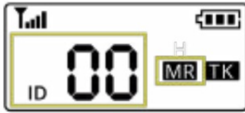
Figure 2: ID Edit Screen (Master ID)

b. One pack must always use the “00” ID and serve as the master pack for proper system function. “MR” designates the master pack on its LCD.