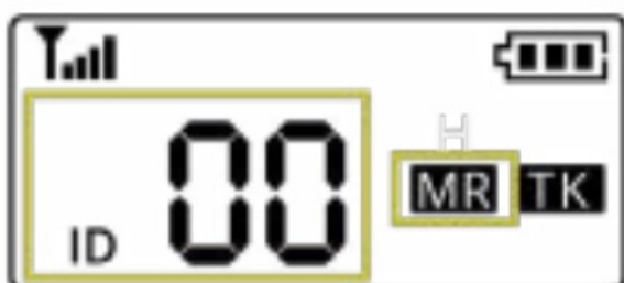
Figure 2: ID Edit Screen (Master ID)