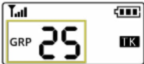
Figure 1: Group Edit Screen