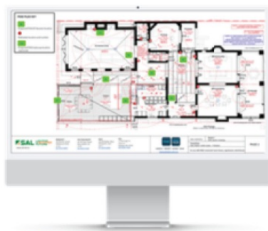
① Marked-up floor plans