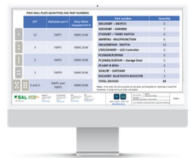
③ Complete product list

Scan the relevant QR code below, complete the form on the web page and attach your project floor plans. In 48-72 hours your free PIXIE smart home design is delivered to your Inbox. This is the easiest way to PIXIEFY your home and creates the best version of a PIXIE smart home.