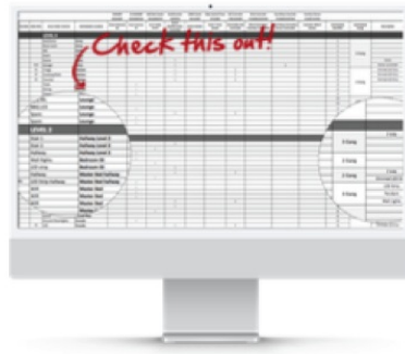
② Every circuit and wall plate