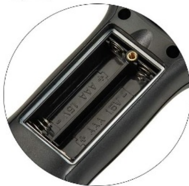
Sealed with Rubber Gaskets