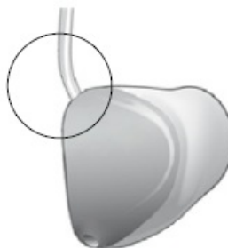
Fig.2 cShell - anterior tube outlet