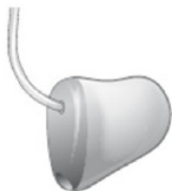
Fig.1 cShell - standard tube