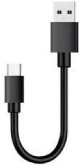
TYPEC Cable ( 30 CM )