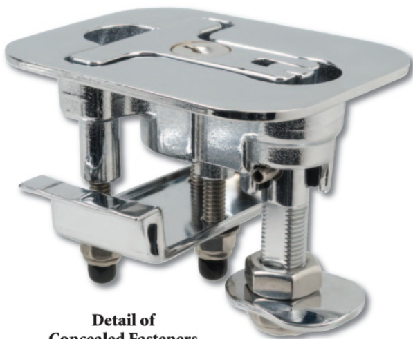
Detail of Concealed Fasteners Bottom Plate