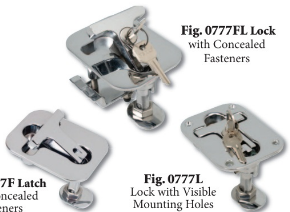
Fig. 0777F Latch with Concealed Fasteners