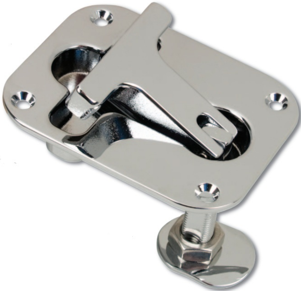
Fig. 0777 Latch with Visible Mounting Holes