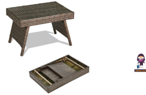
PATIOJOY HW63889 Folding Rattan Side Table