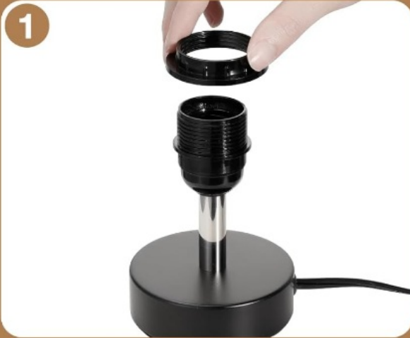
Take the base out of the package