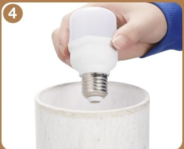
Install the bulb (Note: bulb not included)