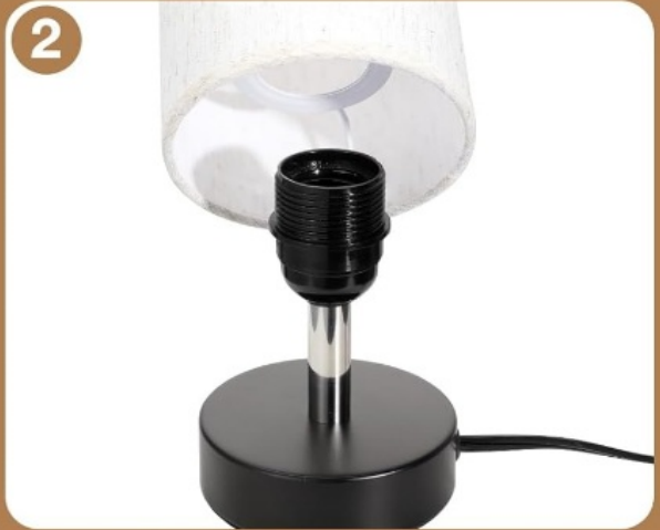
Fix the lampshade on the lampholder