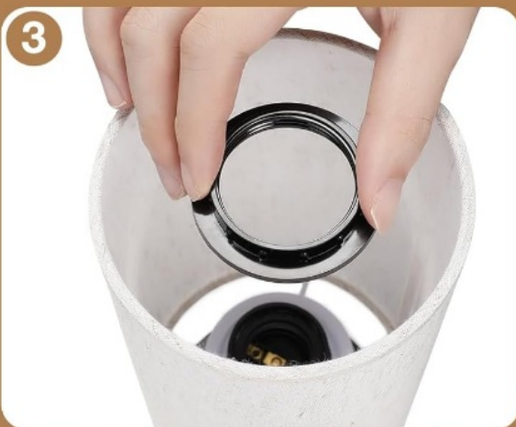
Put the fixing ring back to stabilize the lampshade