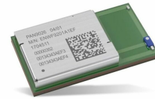
Panasonic WL23B WLAN+BT Module Adapter