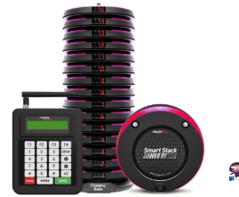
PAGERTEC STO Smart Stack Evo Sleekest