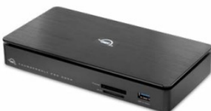
OWC Thunderbolt Pro Dock