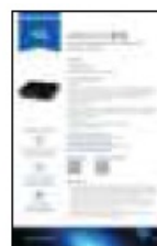
Quick Start Guide