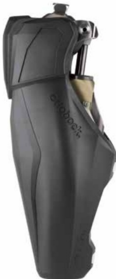
3B5-3 Genium X3

The Genium X3 is prescribed by a physician and may only be provided by a qualified Prosthetist that has received specific product training. Ottobock employs a team of orthotists and prosthetists to educate practitioners on fabricating and fitting our products. This includes in-person and online training, webinars, and technical bulletins. We also provide Cooperative Care Services for the more challenging fittings, which includes on-site assistance with the fitting in conjunction with product qualification training for the practitioner.