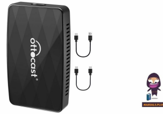
Ottoadapter MX-xxxx Wireless Apple CarPlay Android Auto Adapter