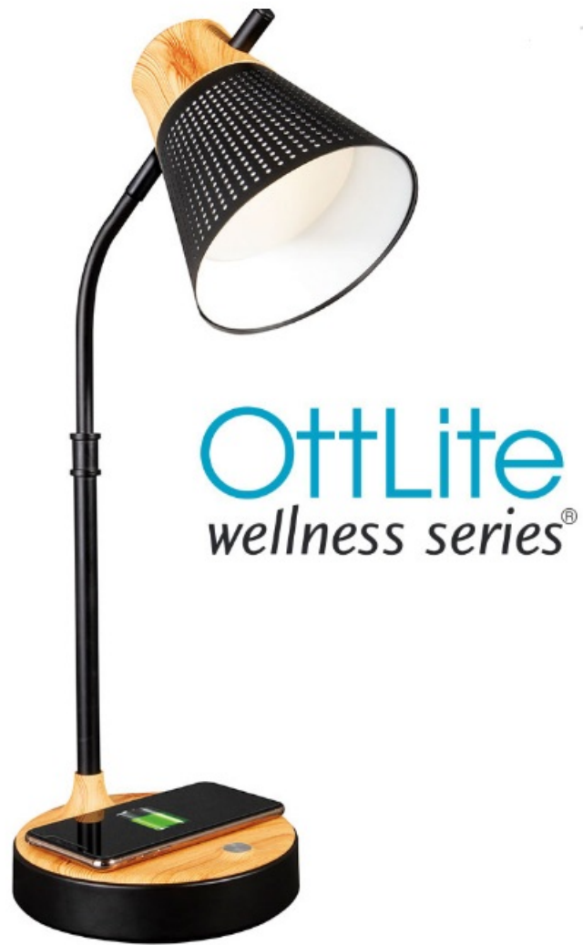
Wireless Charging LED Table Lamp