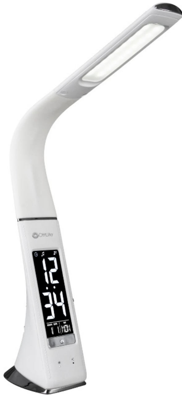
OttLite B1FSB Wireless Charging LED Lamp with Colour Changing Base Instruction Manual