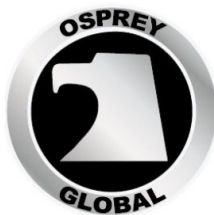
Osprey 600 Lumens Handheld Flashlight