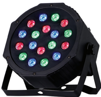
Mini Par Can