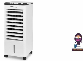
Orbegozo Air 46 Cooler 3 In 1 3 Levels Timer Switch