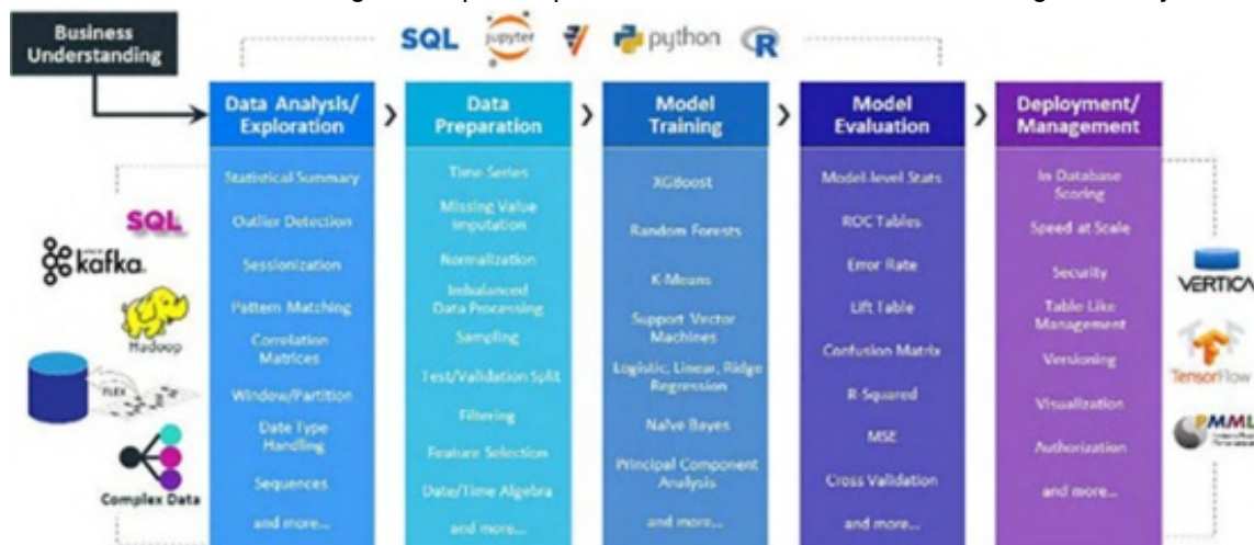
Figure 1. End-to-end machine learning management . From data prep to deployment, Vertica supports the entire machine learning process

Models can also be easily exported from a development, test, or sandbox environment into a production environment (or many production environments). Most traditional approaches involve using different technology stacks for development and production. That makes putting models into production very complicated . An in-database machine learning development platform means much of that hassle goes away .