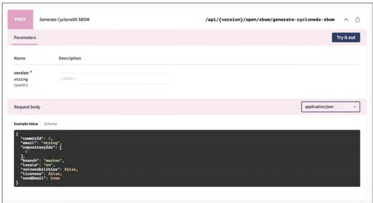
Figure 2. Excerpt from the Debricked API documentation