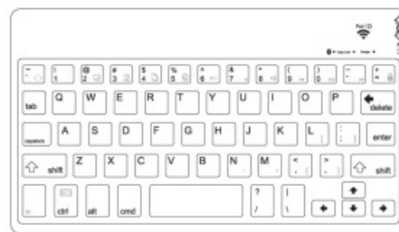
Wireless Bluetooth® Keyboard