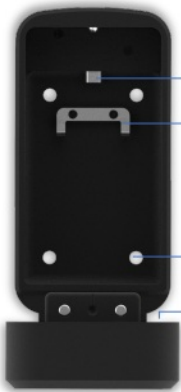
Shackle Switch (for models with portable shackle)