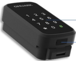
Touch key pad