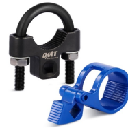
OMT BJS-IT01-00 Inner Tie Rod Removal Tool