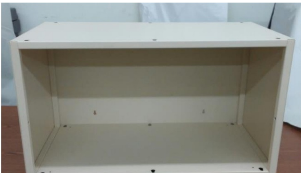
Remove the wire organizer and contents from the Cubbie File Storage Cabinet