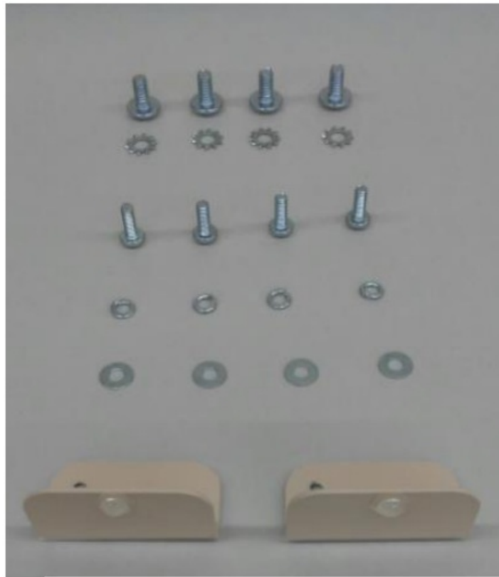
Enclosed hardware and (2) stop plates