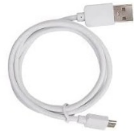
Micro USB Cable ( Durable, 3.2Ft )