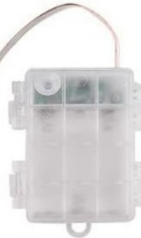
Waterproof Battery Box with Micro USB Port