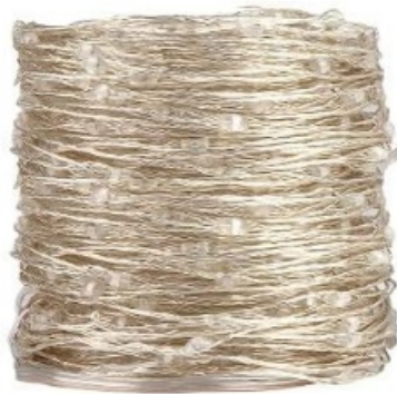
50 LEDs Bulb ( Patent Protected, 16.4Ft )