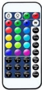
32 Key Remote Control ( 16 Colors, 132 Modes )