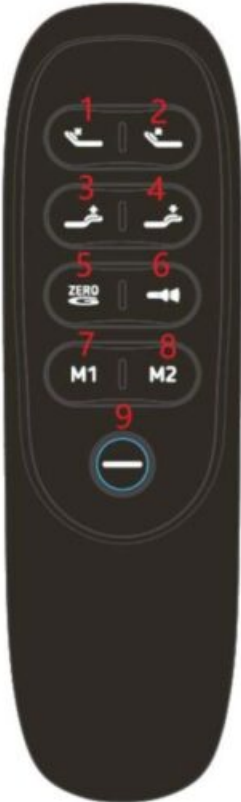
Figure 1 button of remote