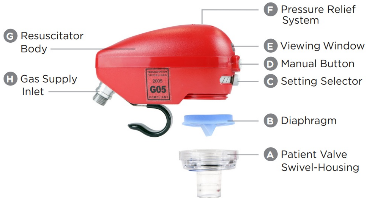
Disassembly of the resuscitator (fig 3.)

Single use patient valves and masks should be discarded after each patient use and replaced with a new unit. All other components should be wiped clean with a mild soap solution. Under no circumstances should the complete unit be allowed to be soaked or immersed in cleaning solutions.