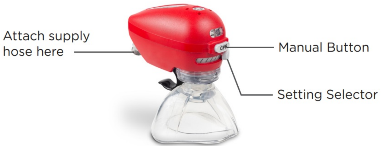
Connecting the supply hose (fig 1)