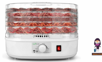
NutriChef PKFD06 Food Dehydrator Machine